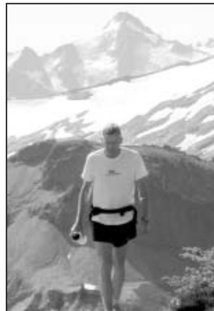
The Copper Ridge and Hannegan Peak Adventure Run — great weather and stunning views!

1209 Eleventh Street | Fairhaven Historic District | 360.676.4955 | Store Hours Mon - Sat: 10 - 7 / Sun: 11 - 5